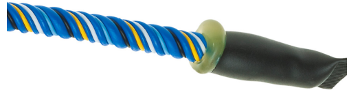
FG-ECS Sense Cable End Termination Tip

2 Communication Wires and 2 Wires for Locating